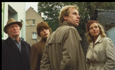
Still from The Wrong Move