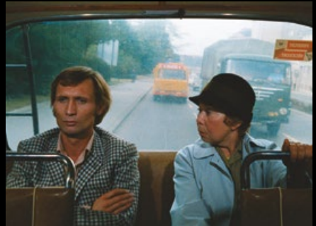
Still from The Goalkeeper's Fear of the Penalty

Austria/Germany, 1972, 101 min, German with English subtitles, directed by Wim Wenders