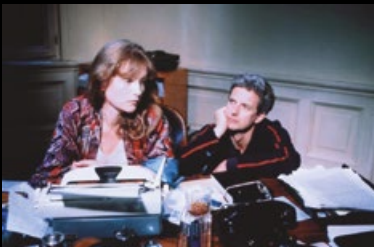
Still from Malina

Austria/Germany, 1990, 118 min, German with English subtitles, directed by Werner Schroeter