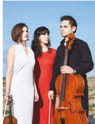
Trio Immersio