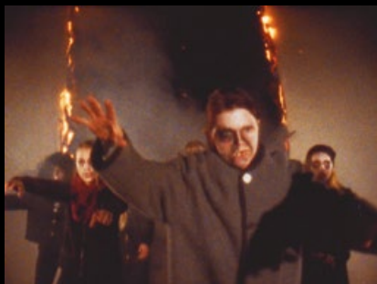
Still from The Children of the Dead

Germany, 1975, 103 min, German with English subtitles, directed by Wim Wenders adapted for the screen by Peter Handke