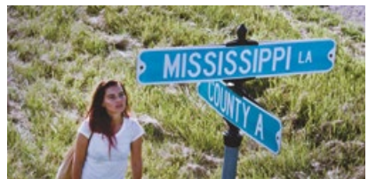
Still from the film Lillian

www.glasgowfilm.org/glasgow-film-festival