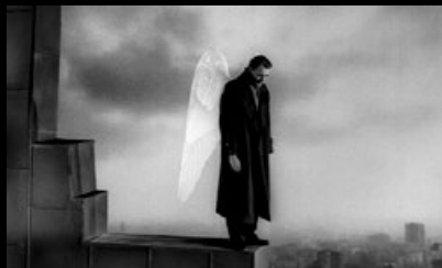
Still from Wings of Desire