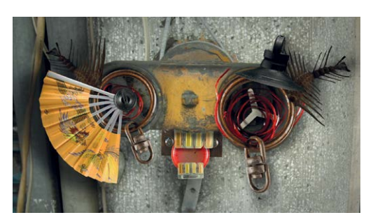
Tricky Women: Taipei Recyclers by Nikki Schuster

The Freud Museum London hosts a special animated film evening featuring a selection of animated short films by female filmmakers to accompany their exhibition 'So this is the Strong Sex' Women in Psychoanalysis at the Freud Museum London. The films were first screened