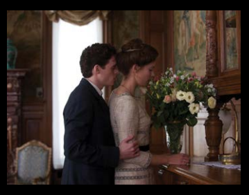
Still from A Promise

France, 2013, 95 mins, English, directed by Patrice Leconte