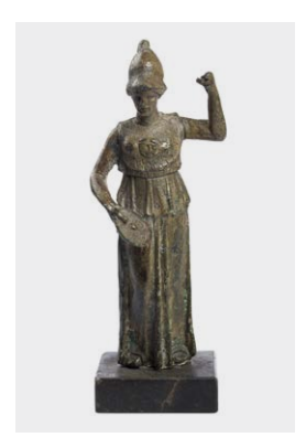
Athena, Freud Museum

The exhibition at the Freud Museum London, presented in collaboration