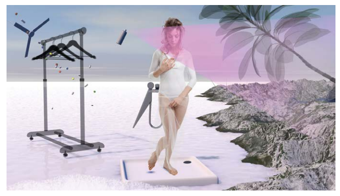
Georg Eckmayr's A Landscape of Me

The series of photographs, a mix of personal snapshots, intimate portraits and commissioned documentary and fashion stories, also chronicles the radical political and social changes that have transformed London in the last ten years.