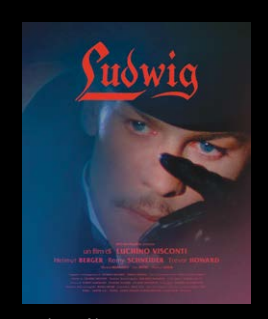
Ludwig, film poster

USA, 1973, 238 mins (Part I: 126 mins / Part II: 112 mins), English, directed by Luchino Visconti