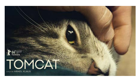
Kater, from Fringe! Festival

Uprooting Ghosts, Saturday 18 November, 5pm, Hackney Showroom, Hackney Downs Studios, Amhurst Terrace, London E8 2BT fringefilmfest.com