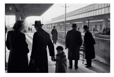
The Western Railway Station in Vienna, Austria 1953

Freud Museum London, 20 Maresfield Gardens, London NW3 5SX www.freud.org.uk