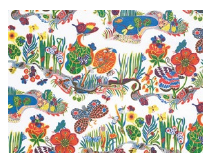
Josef Frank, textile design

Fashion & Textile Museum London, 83 Bermondsey Street, London SE1 3XF www.ftmlondon.org