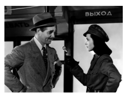
Still from Comrade X

US, 1940, 104 mins, English directed by King Vidor