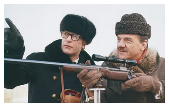
Still from Billion Dollar Brain

Sadler's Wells Theatre Rosebery Avenue, London EC1R 4TN www.breakinconvention.com www.hungrysharks.at