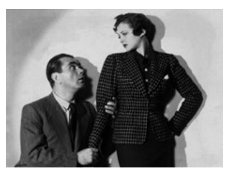
Still from Sabotage

UK, 1936, 74 mins, English directed by Alfred Hitchcock