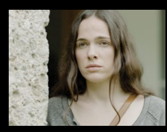
Still from Die Beste Aller Welten