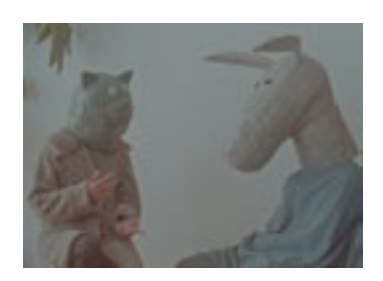
Gernot Wieland, Thievery and Songs