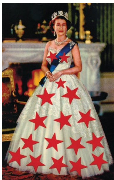
Mladen Stilinović, Red-Pink Queen , 1976

by some of the most prominent artists from Central, Eastern and South-East Europe since the 1960s, the exhibition stages an interplay between these and newly produced works that interpret and critically examine the collection.