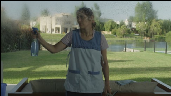
Still from A Decent Woman