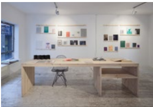
burning with pleasure

Seen Fifteen, Bussey Building, 133 Rye Lane, London SE15 3SN archipelagoprojects.com