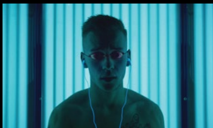
Still from Agonie