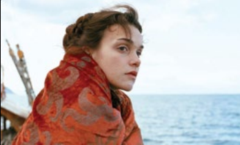
Still from Mary Queen of Scots

Each month in 2017 the ACF's Cineclub screens a film based on and inspired by the works of Austrian author Stefan Zweig to celebrate the release of the film Farewell to Europe based on the author's life in exile.