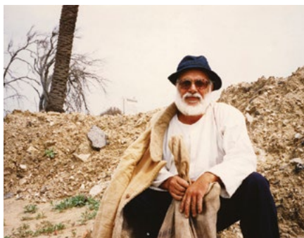
Still from Towards Jerusalem (1990), Ruth Beckermann

Close-Up Film Centre, 97 Sclater Street, London E1 6HR www.closeupfilmcentre.com