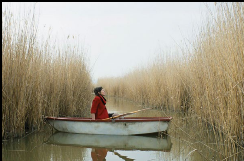
Still from Ugly