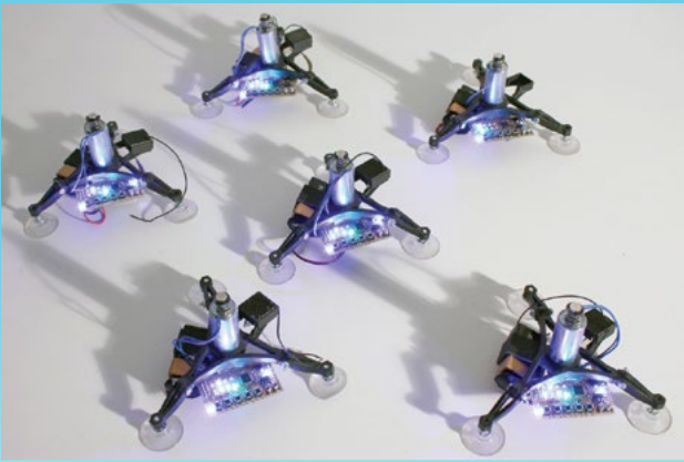
Leo Peschta, Roboter 10pcs BM MK II , 2011