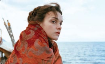
Still from Mary Queen of Scots

Each month in 2017 the ACF's Cineclub screens a film based on and inspired by the works of Austrian author Stefan Zweig to celebrate the release of the film Farewell to Europe based on the author's life in exile.