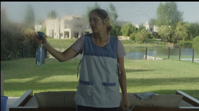
Still from A Decent Woman