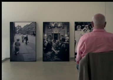
Still from The Photographer in Front of the Camera

Austria, 2014, 66 min, German with English subtitles, directed by Tizza Covi & Rainer Frimmel