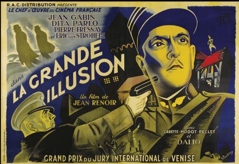
Poster of La Grande Illusion

Germany/France, 1931, 93min, French and German with English subtitles, directed by Georg Wilhelm Pabst