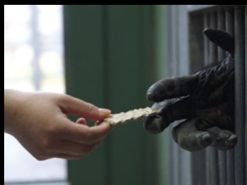
Still from Animals and Other People

Flavio Marchetti's debut documentary is a tender reflection on the relationship between humans and animals. The film is set in a Viennese animal shelter housing over 1,000 animals, from unwanted domestic pets to confiscated