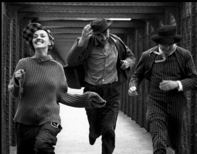
Still from Jules et Jim