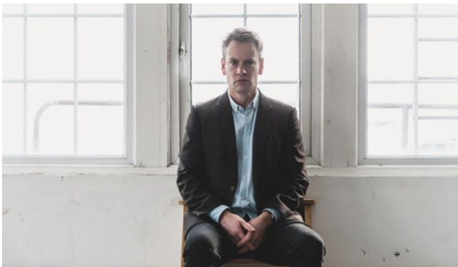
The Soul of Wittgenstein

Students from the University of Applied Arts Vienna and Kingston University present a programme of digital animation and