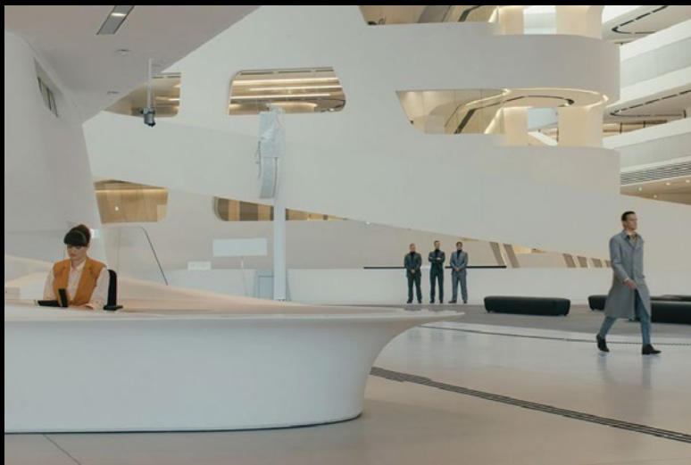
Still from Life Guidance