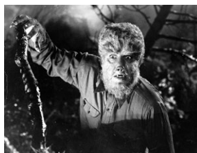
Film still from The Wolfman