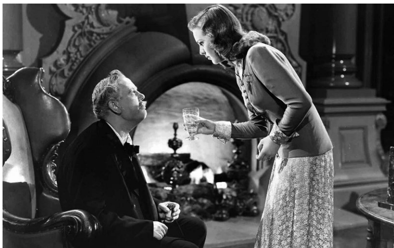
Film still from It Started with Eve