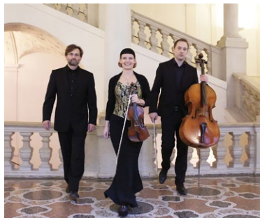
Trio Van Beethoven