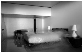
Bernd Oppl, Hotel Room