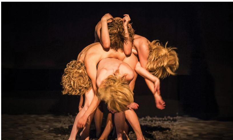
Editta Braun Company, Close Up